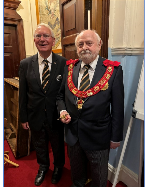
It was good to see so many guests from other Provinces at the meeting to support the Provincial Grand Senatus of Surrey