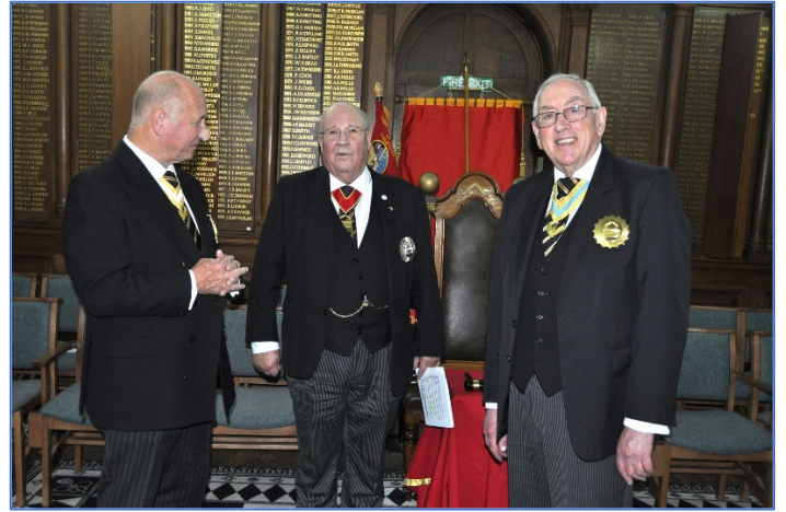
At the same time, rehearsals were taking place in the George Cowan Temple under the direction of the Grand Director Ceremonies.